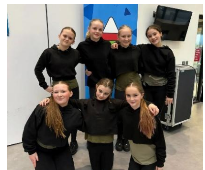
Urdd Dance Group 2026

Launch of My Voice : In September 2024, Fy Llais (My Voice) was launched at the school to offer pupils the opportunity to reach out for help and advice. Following reports such as: " Why don't we tell our teachers " and " Everyone's Invited " this has been an important step in telling our students that they are not alone and that staff are available in times of crisis for support and guidance. In addition, an online information evening was held for parents (in conjunction with Glantaf) about online safety issues with a professional practitioner from Everyone's Invited . The evening was hugely popular with parents receiving important information about young people's messaging through apps and how influencers affect and target young people through technology.