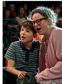
Billy Elliott Musical

Our Billy Elliott Musical Drama, staged in March, was a fresh, Welsh and energetic performance featuring a host of the school's talents. The show was an opportunity for two sets of main characters to take on the challenge of performing four times to packed halls who enjoyed every moment of touching and highly mature performances. The pupils' performances overall were outstanding and the maturity and clarity of communication and engagement with the audience was evident. Congratulations to all the pupils who took part so brilliantly, supported and directed by the teachers and staff of Bro Edern.