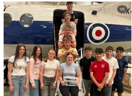
STEM Aero Challenge Yr11

In September 2025, we continued our priority to invest in Digital Technology by providing all pupils in Year 7 with a personalised Chromebook. Through the investment of Welsh Government, through the City of Cardiff Council, we have been able to provide every pupil from Year 7 to Year 13 with a personal device. This significant investment has enabled us to review our curriculum and integrate digital skills into teaching. However, this central funding is likely to have come to an end, and we will need to review our provision for September 2026.