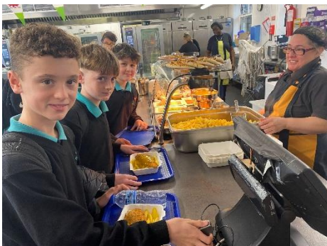
School Lunch: Bro Edern

Mobile Phone Use: In response to the growth of mobile phone misuse in the school community, including incidents of inappropriate use of social media and online bullying, we reviewed and strengthened our response to mobile phone use on campus. As of September, we adopted a much stricter protocol on mobile phone use which has reduced usage. The new protocol has been supported by parents and staff.