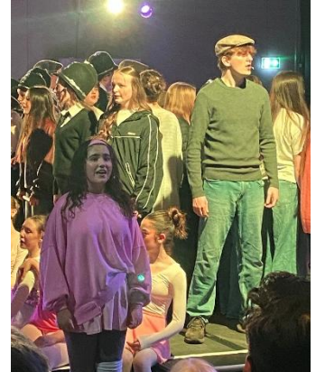
Finale, Billy Elliott