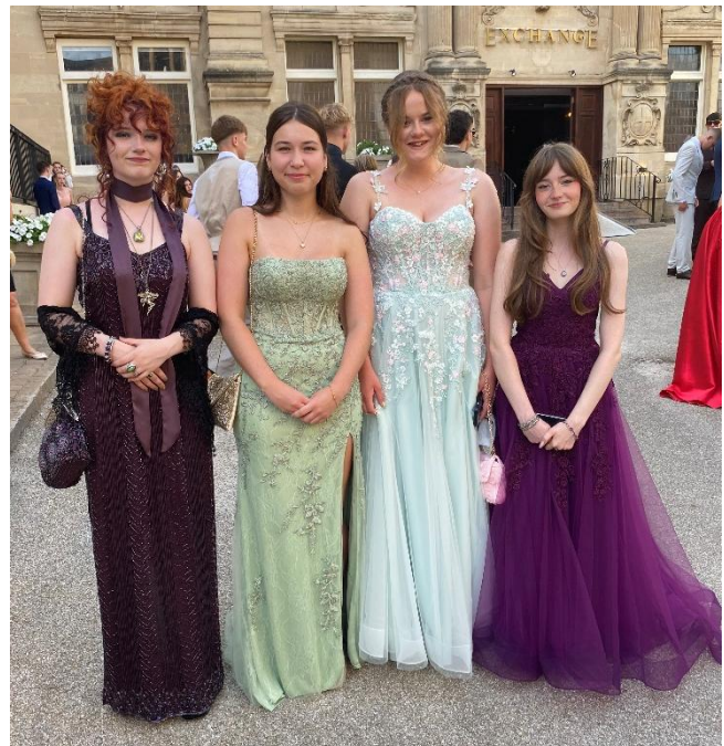
Year 11 Farewell Dance, 2026