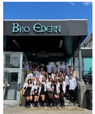
Farewell Year 13, 2026

Within the Sixth Form, we were pleased to welcome a good number of pupils who choose to return or join Bro Edern in Year 12. This included a new Level 3 Engineering course being offered here at Bro Edern and which from September 2026 will be open to pupils across BroPlasTaf. We are pleased to continue our partnership offers through BroPlasTaf, which extends our option columns with 36 different courses for KS5 students. One of the special courses here is the Level 3 Cache Childcare course which offers a specialist Welsh-medium study and training pathway within the city. We are very proud of the fact that all pupils who have taken this course have been offered a full-time job or continued their study within the field to a higher level over the past few years.