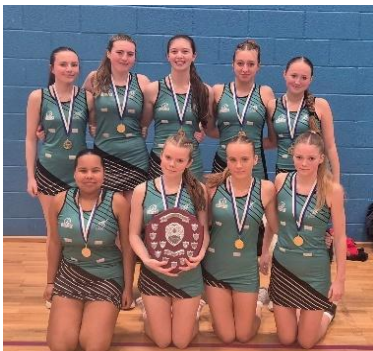
County Netball Champions u16

Following our inspection in March 2025, the school was placed in Special Measures and we received 5 recommendations to address for the future. During the year we have received two visits so far (December 2025 and March 2026) with a visit yet to take place in the Summer Term. The feedback from these visits indicates that there has been good progress in several aspects of the recommendations. The reports cite "improved consistency in the structure and order of lessons ... In the most effective lessons, there are rich opportunities for pupils to develop their oral skills and teachers question skilfully to encourage pupils to extend their answers." They also talk about seeing the impact of the school's teaching strategies to promote speaking and listening, noting that pupils respond more maturely and with a better grasp of specialist vocabulary. Nevertheless, our provision needs to show more consistency, and at times there needs to be more ownership within pupils' workbooks and a clearer focus on writing skills.