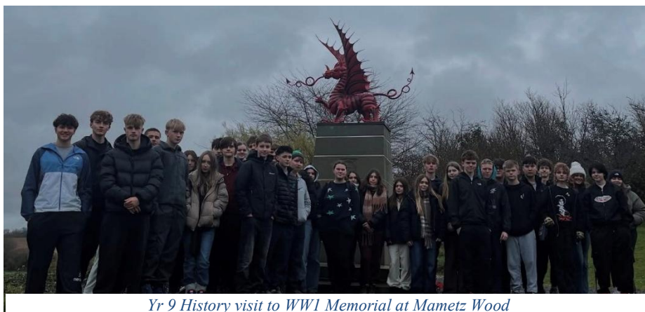
Yr 9 History visit to WW1 Memorial at Mametz Wood