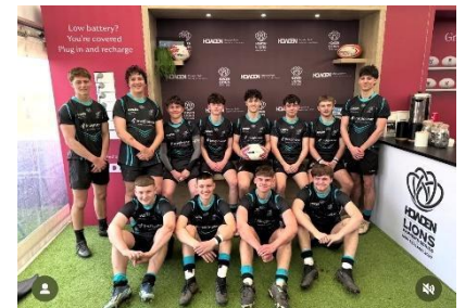
Rosslyn Park u18 2026