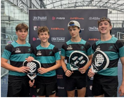
Yr10: Welsh Padel Champions