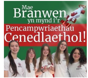
Branwen STEM Racing team