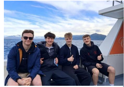
Geography field trip to Southern Italy