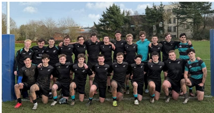
Yr 11 XV: County Champions 2024, 2025 and 2026