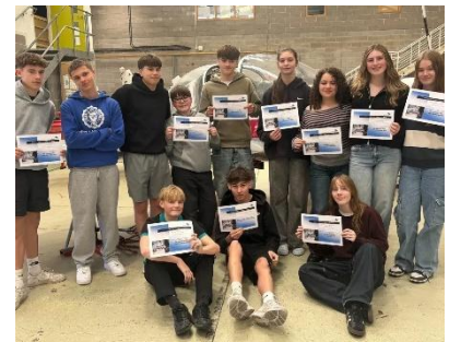
STEM Aero Challenge Yr10