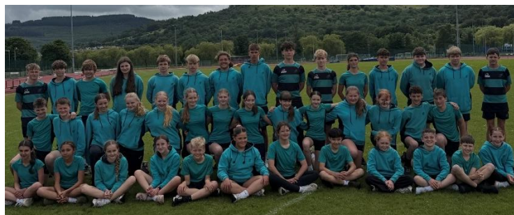
Athletics Team 2026