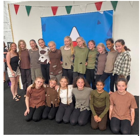
Eisteddfod yr Urdd Dance Group