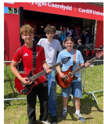
Hunllef Band, Tafwyl