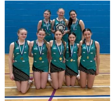
County Netball Champions u14

It was a pleasure to take part at the Urdd National Eisteddfod, Ynys Mon during the Whitsun holidays. The students of Bro Edern were represented in many competitions, and may I thank all the pupils who represented the school with such energy and to staff for their support and coaching of different individuals and groups. It was great to see the dance groups, recitation group and individuals in the music competitions representing the school with so much passion at the far corner of Cymru! A big thank you to all the students who competed with so much enthusiasm in all the various competitions – and I hope you enjoy your experience on Ynys Mon, Mam Cymru!