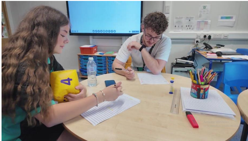
Cwtsh and Hafan provision at Bro Edern